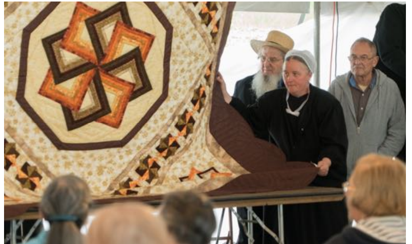
Handmade quilts and other goods at the auction.