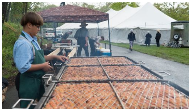
Plenty of fresh food and homemade goodies.