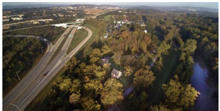
Aerial view of the Nicholas Stoltzfus Homestead.

Goal is to have occupancy of the barn by the auction 2018. Earlier a number of drywallers volunteered to be at the barn when needed! Soon we will need you. Call Dave Esh, builder, to arrange 717-951-0166.